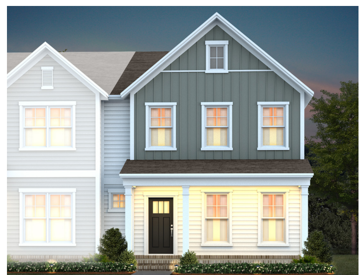
Elevation 2 Elevation 5