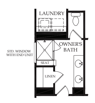
Owner's Bath #3